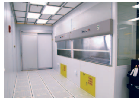
Top: Birck Nanotechnology Center, Purdue University. Middle: Plascore cleanroom system is hard at work. Bottom: Plascore walls readily adapt to special 3rd party doors and bulkheaded equipment.