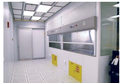
Top: Birck Nanotechnology Center, Purdue University. Middle: Plascore cleanroom system is hard at work. Bottom: Plascore walls readily adapt to special 3rd party doors and bulkheaded equipment.