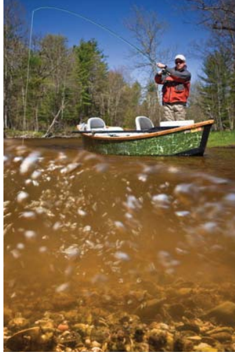
Stealthcraft – Baldwin, Michigan

In many cases a sandwich structure's main contributor of flexural rigidity comes from bending. This bending resistance is contributed from the laminate schedule and how far apart those two stress skins are from each other or the overall panel thickness. Though important, but to a lesser degree, the shear component of flexural rigidity is contributed by the cores shear resistance. Finding the right combination of laminate schedule, overall panel thickness and core properties can save you weight and money, while still meeting your application performance requirements.