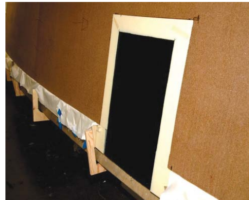
Nomex® honeycomb fit around the chain plate on a 65' hull.