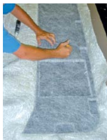
PP Honeycomb and materials are fitted for Lite RTM.

Incorporating technologies learned in building Cobalt yachts, the A25 presents a profile never before seen in its class. The hull's shape requires a five-piece mold, a no-shortcuts exercise in hand craftsmanship. Because of new structural design mandated by the A25's optional deployable swim step, the running surface is more that of a 27-footer, with reduced bowrise upon acceleration, more stability in turns, and even offers more comfort at cruise for all aboard.