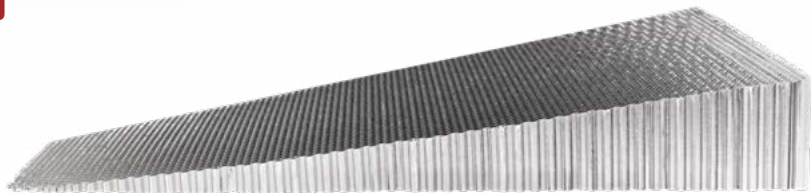
Contoured surface cutting and inspection