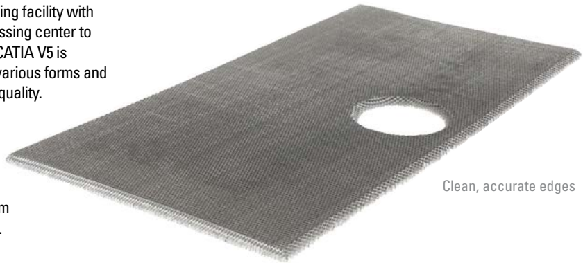
Clean, accurate edges

Plascore offers processing to customer specifications and has facility approvals from several Aerospace OEMs. Our team of engineers work hard to provide unique solutions to complex designs while our Customer Service team offers excellent responsiveness and fast quotations.