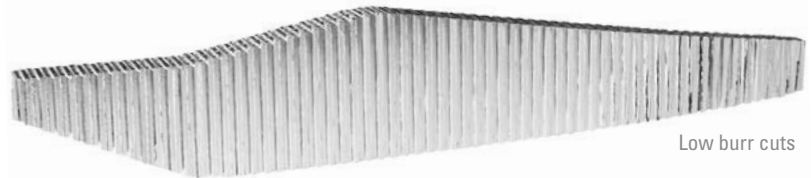
Low burr cuts