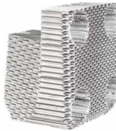
High density machining