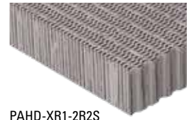
PAHD-XR1-2R2S Bisectioned Reinforced Staggered Corrugated Aluminum Honeycomb