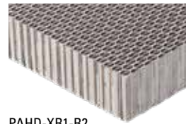
PAHD-XR1-R2 Bisectioned Corrugated Aluminum Honeycomb

Plascore PAHD can meet virtually any structural requirement for lighter yet stronger materials to enable the manufacturer to build structures that travel faster with reduced environmental impact. Lightweight applications in aerospace and high-speed rail, for example, include floors, doors, ceilings and bulkheads.