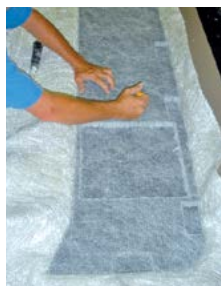
PP Honeycomb and materials are fitted for Lite RTM.

Incorporating technologies learned in building Cobalt yachts, the A25 presents a profile never before seen in its class. The hull's shape requires a five-piece mold, a no-shortcuts exercise in hand craftsmanship. Because of new structural design mandated by the A25's optional deployable swim step, the running surface is more that of a 27-footer, with reduced bowrise upon acceleration, more stability in turns, and even offers more comfort at cruise for all aboard.