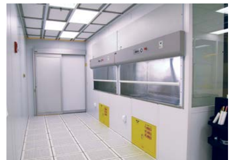
Top: Birck Nanotechnology Center, Purdue University. Middle: Plascore cleanroom system is hard at work. Bottom: Plascore walls readily adapt to special 3rd party doors and bulkheaded equipment.