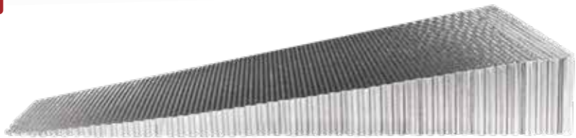
Contoured surface cutting and inspection