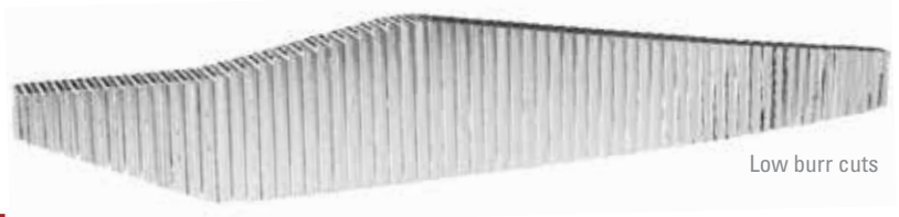
Low burr cuts