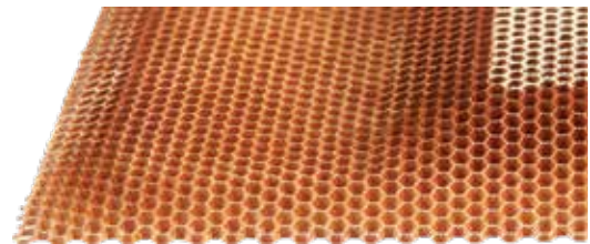
Kevlar ® machining