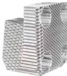
High density machining