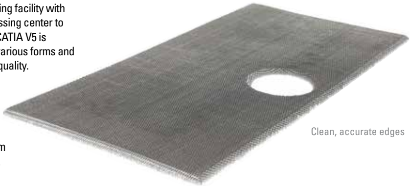
Clean, accurate edges

Plascore offers processing to customer specifications and has facility approvals from several Aerospace OEMs. Our team of engineers work hard to provide unique solutions to complex designs while our Customer Service team offers excellent responsiveness and fast quotations.