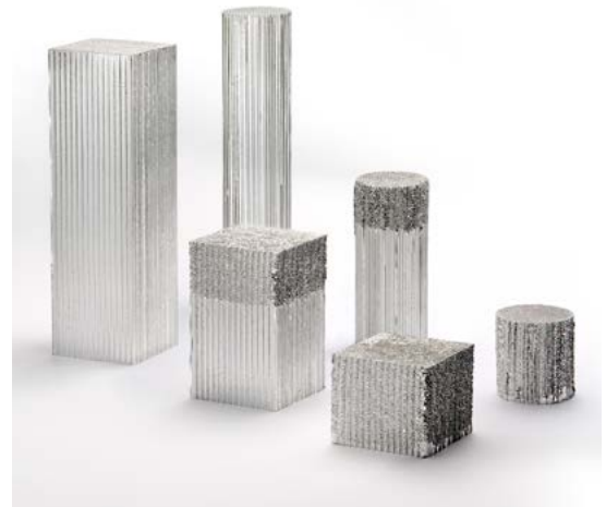
CrushLite™ absorbs energy by crushing under load

Transportation – Attenuates impact in Automotive and Rail applications where lightweight, high-performance energy absorption is critical for safety.