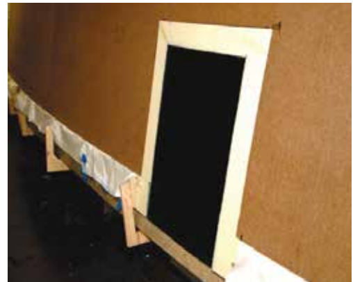
Nomex® honeycomb fit around the chain plate on a 65' hull.