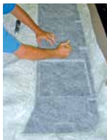
PP Honeycomb and materials are fitted for Lite RTM.

Incorporating technologies learned in building Cobalt yachts, the A25 presents a profile never before seen in its class. The hull's shape requires a five-piece mold, a no-shortcuts exercise in hand craftsmanship. Because of new structural design mandated by the A25's optional deployable swim step, the running surface is more that of a 27-footer, with reduced bowrise upon acceleration, more stability in turns, and even offers more comfort at cruise for all aboard.